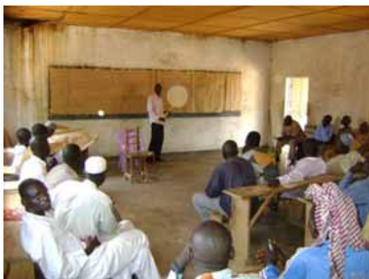
Workshops for the education of the parent associations.

Phase 3 finally deals with the evaluation of all results. All schools and parent associations have been revisited. The project provoked positive reactions both in Switzerland and in Cameroon. “It feels good to help poor people”, says one of the students involved, and another: “It’s a pity that it is already over”. It is interesting to observe that, while it was the boys who pushed this ambitious project, it was the girls who clearly showed more dedication in the end.