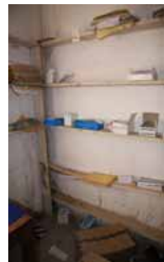
Empty shelves in the pharmacy...

Around 500,000 people find themselves in this unfortunate position. In this region, which is amongst the poorest in Cameroon, medical facilities can only be found in three villages – and in these the most elementary infrastructure is missing: there are no sanitary installations, no treatment facilities, no medicines. In addition, the medical centres are too far away or are inaccessible during the rainy season.