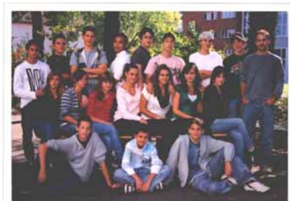
The “carwash activity” of the secondary school in Spreitenbach was the base for the financing of the parent association project. On the image is class S4a.

This is where the project to strengthen the parent associations sets in; it is a “help for self-help” project in its classic form. The idea came from the schools themselves and from the school director responsible for Zina, whose dedication for the schools in the region is exemplary. The project is budgeted at CHF 18,500.