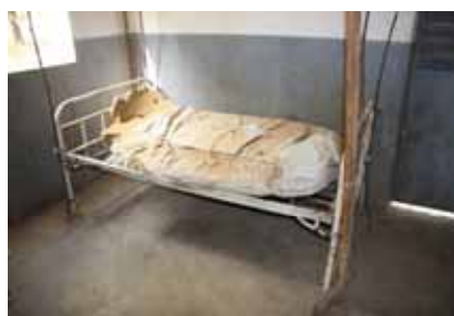
...and dilapidated medical centres.

The "Arams" organisation approached IPA for help. Its objective was to support the villagers of this flood-prone region in